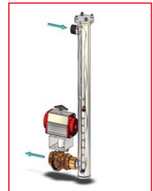
MAGNETIC CORE IN SEPARATION MODE