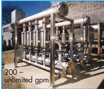
200 - unlimited gpm