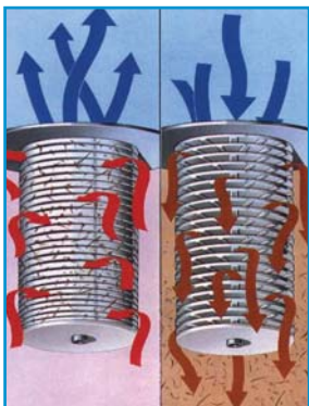
FILTRATION ACTION AND BACKWASH ACTION