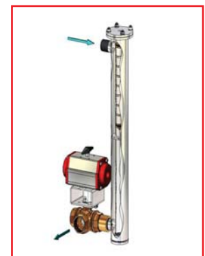
MAGNETIC CORE IN PURGE MODE