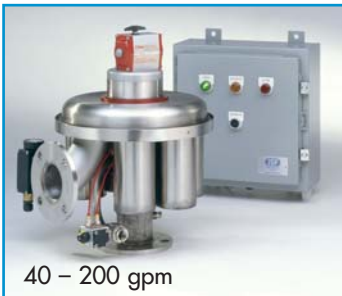
40 - 200 gpm

Zero Gravity offers modular designed solutions to handle flow rates from one GPM to unlimited with 20 to 400 micron absolute filtration.