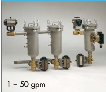
1 - 50 gpm