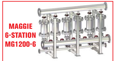
MAGGIE 6-STATION MG1200-6

Individual Maggie units can be combined to meet any flow rate and loading condition.